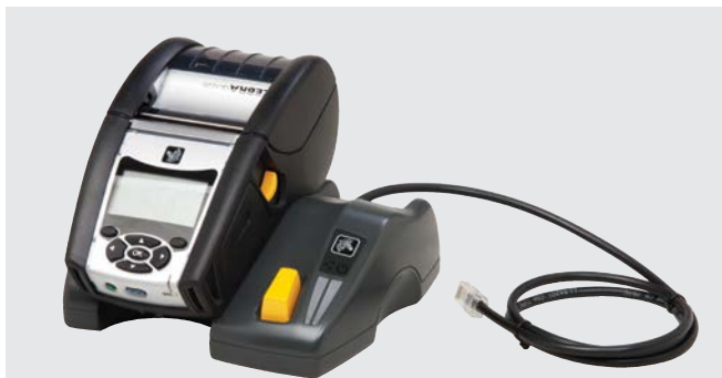
Single-bay QLn Ethernet Cradle