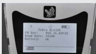
Easy-to-read display with larger, higher-resolution screen