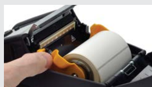
Intuitive peeler operation