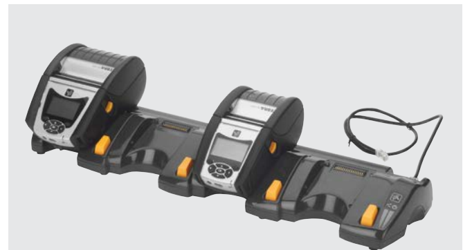
4-bay QLn Ethernet Cradle