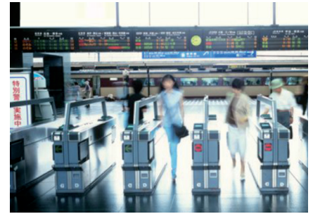
Access control and Ticketing