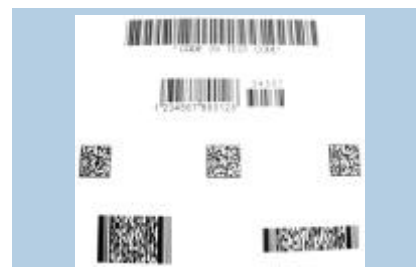
Multicode A5 sheet reading